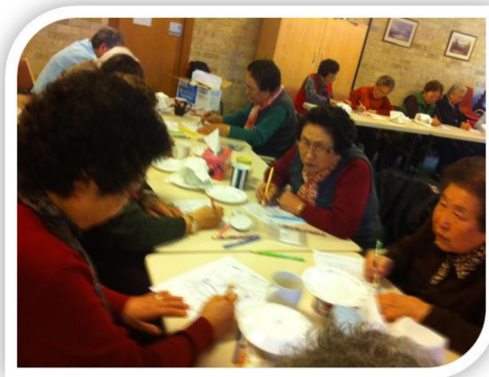
Outing to Mittagong