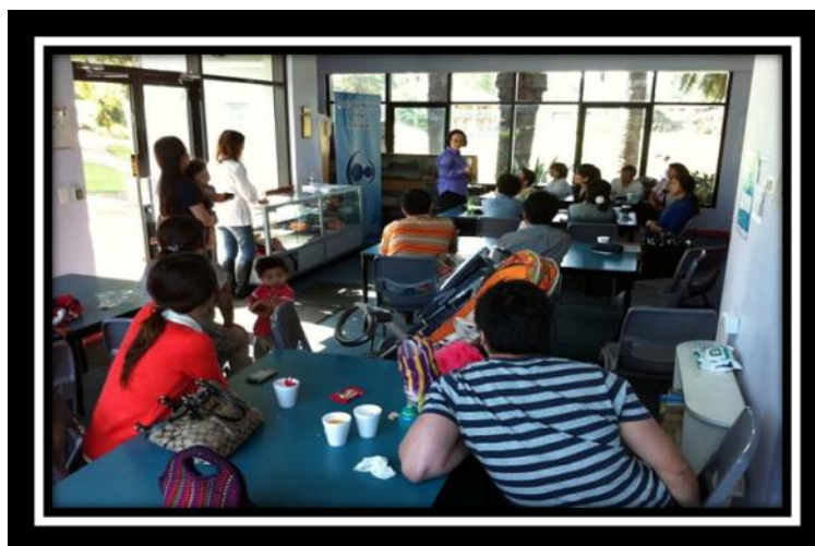
Budgeting towards First Home session held at Women's Rest Centre, Eastwood

AKWA found Korean magazines proved to be very effective in drawing these potential clients’ attention to the session.