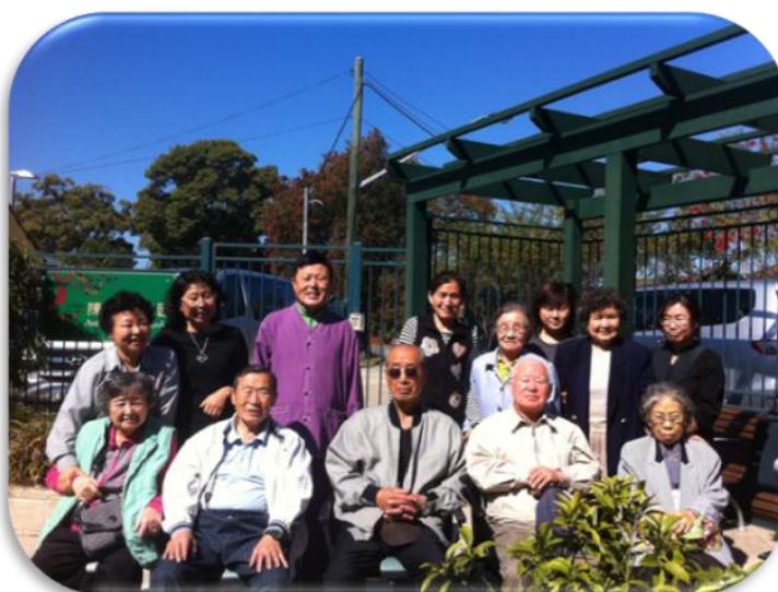
Outing to Rockdale Beach

AKWA would like to express sincere gratitude to Bridget Tam and Elisha Chan, So Wai Centre. They have been highly supportive in every aspect of AKWA running the Aged Day Care 2. Its success would not have been possible without our committed volunteers too.