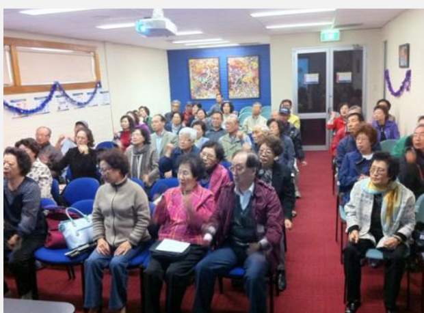
Session photo from Living with diabetes

AKWA organised a series of health information sessions with Parramatta Civic Library, targeting health-conscious Korean community living in Parramatta LGA. Information sessions covered various topics including eye diseases, diabetes, and other health conditions and preventive measures.