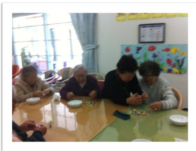
Paper Folding Activity

AKWA has provided culturally appropriate programs for these frail, mildly disabled people in their older age and some of them are dementia patients. Therefore the new challenge lies in how to improve carers' knowledge of what the elderly with dementia go through and develop appropriate activities and programs for their particular needs.